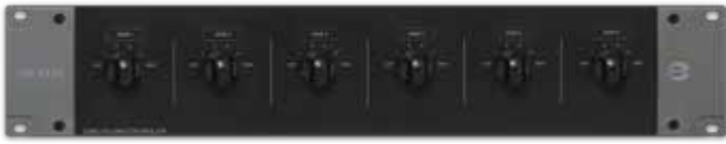
VR7600 - Rack Mounted Zone Volume Controllers

VR series is available in three variants with 6 zones at each panel, to be mounted at rack to enable volume of each zone to be controlled or set at the control room.